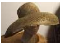
#136 "Saks 5 th Ave./Italy" gold mesh straw with flower pattern design