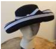
#75 "Brenda Waites Bolling" black and gray wool hat with gray wool trim, wool ribbon