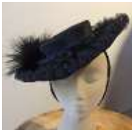
#78 "Original Roberta Bernays" black silk taffetta, netting trim embellishment with ostrich feather