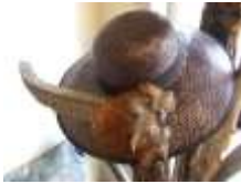
Black straw with pheasant feathers