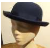
#179 "Edward Mann/England" classic navy blue bowler with matching ribbon