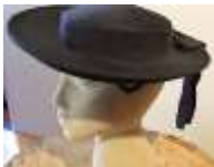
#71 Black woven straw with grosgrain ribbon, back ribbon, hat pin