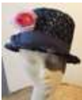
#85 Dark navy woven straw, fedora-style with grosgrain ribbon with rose (union-made #956141)