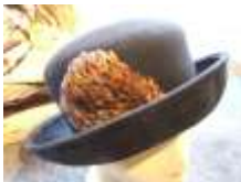
Black felt, cup brim with pheasant feather accents