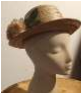
#120 Fedora straw with grosgrain ribbon and silk rose