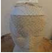
#95 Cream veil with bow headpiece