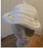
#103 "Ruth McCabe/1958 inscription" – Cream stain with tafetta layers