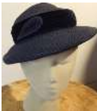
#55 Navy woven straw with velvet band, straw faux feather accent