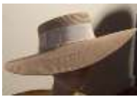
#187 Large brimmed straw hat with wide grosgrain ribbon