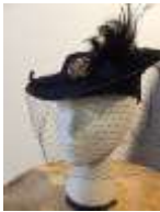
#82 "Glenover/Aldenaire Hat & Accessory" 100% Black wool "pirate" style with black veil, wool bow, black feathers, gold "flower"