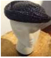
#68 Black woven straw, patterned straw with matching hat pins