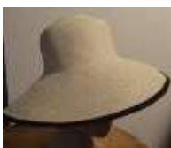
#125 Woven straw with black ribbon brim