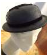
#56 "Battlestein/Houston" black woven straw, velvet ribbon accent