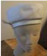
#98 I. Magnin cream linen