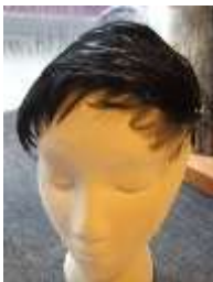
Black feathered head piece with jewels on side