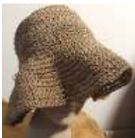
#137 Packable crocheted raffia