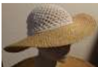
#122 Crocheted crown with woven wide straw brim