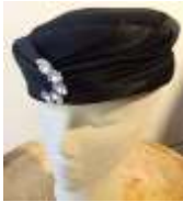
#80 "Park Lane Originals/Dallas" black wool felt with satin ribbon, rhinestone accent