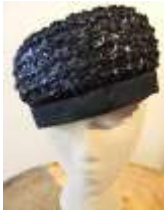
#88 Woven straw with grosgrain black ribbon, band and bow