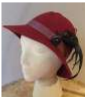
#171A Maroon wool felt "Lancaster", with wine grosgrain ribbon, bow at back, indented crown with black feathers and black button