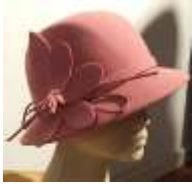
#175 "San Diego Hat Co." pink wool with elaborate pink wool accent