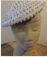
#96 Cream woven chapeau, grosgrain ribbon