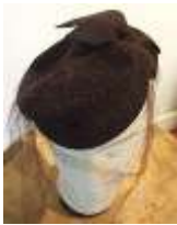
#54 100% wool, Henry Pollack Inc., New York dark brown with large side bow and veil