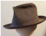
#105 "Dorfman Pacific" dark grey wool