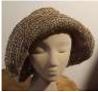
#142 Woven crushable straw