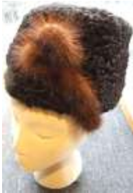
#20 Reproduction of Jean Paton, Paris; black caracul fur with mink tail trim