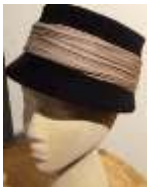
#178 Modified cloche imported fur velour with taupe silk pleated band