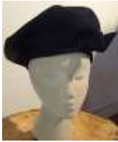
#66 "I. Magnin" navy felt with felt bow