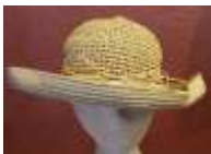
#123 Woven straw "crush" hat, texture and raffia ribbon band