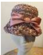
#86 Peach/copper woven straw and netting cloche style hat with satin peach ribbon