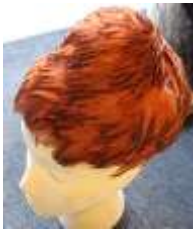
#13 Red feathered head piece