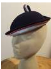
#65 "I. Magnin/Mallory" navy felt with silk red and white feather-like accent