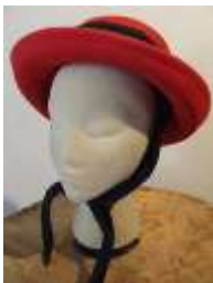
#24 Red felt with black jersey, "Street Smart" scarf hat by Betmar