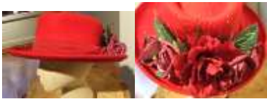
#176 "Scala" red wool with chiffon ribbon and large silk roses