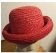
#146 Bowler style red woven straw