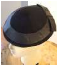
#77 "Marian Marcia Exclusives" brushed wool with satin ribbon