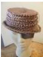
#84 Copperish, tan woven straw, fedora style with veil top (union-made #441413)