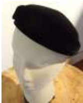
#63 "Mr. John" black velvet