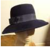
#174 "Adolfo/New York, Paris" dark navy wool with matching grosgrain ribbon