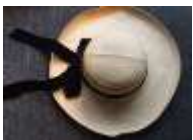
#138 Child's hat tightly woven linen straw with black velvet ribbon and bow