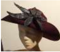
#182 Wine wool with velvet ribbon, black petal accent