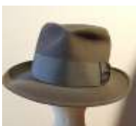
#109 "Hastings" (SSJ initials) grey-green brushed wool w/matching grosgrain ribbon