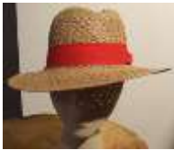
#135A Fedora style woven straw with pleated silk ribbon band