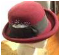
#170 Maroon 100% wool bowler, doeskin felt, black grosgrain ribbon w/feather accent