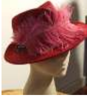
#183 "Amanda Smith" red wool fedora style with pink ostrich feather & key-chain accent