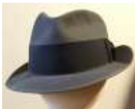
#107 "Brooks Bros" grey with black grosgrain ribbon