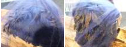
Blue feathered, jeweled with veil and silver bow at back, cocktail hat, 1940s