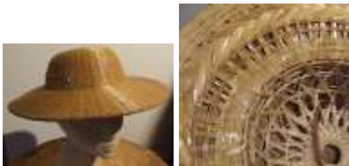
#121 Traditional Asian or Chinese "coolie" hat, woven with rattan wood, intricate design