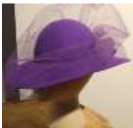
#177 Purple wool with lots of purple veiling