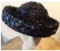
#83 "Oleg Cassini" black woven straw, various sizes of grass/straw