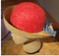
#119 "Gymboree" woven straw, red crown with natural brim and blue bow at back