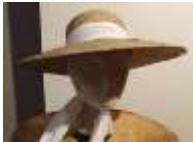
#185 Large brimmed straw hat with white scarf band and tie