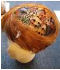
#14 Multi-colored feathered headpiece