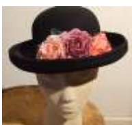
#172 Black bowler style wool with black grosgrain ribbon and pink/purple flowers