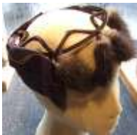
#22 "Clover Lane" (#729664) Brown mink with satin bows headpiece cocktail hat