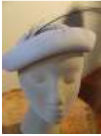
#94 "Junior Seasons New York" cream felt with black feather