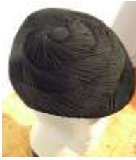
#58 "I. Magnin" black pleated silk in snail pattern