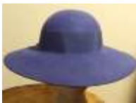
#169 "Mr Fields" blue wool with wide grosgrain ribbon