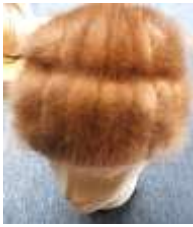
#19 "Deborah", Autumn-haze mink