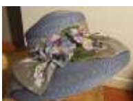
#151 "Hopelessly Romantic" blueish-grey tightly woven straw with gray silk ribbon and silk, painted pansy flowers