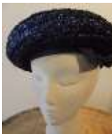
#89 "Eva Mae Modes" navy woven straw sailor hat w/grosgrain ribbon, band & bow