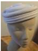
#99 "Hattie Carnegie/I. Magnin" white fabric snail roll brim with large button top