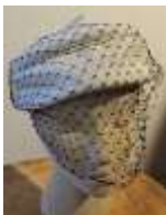
#100 "Jolyn Original" cream wool with black veil