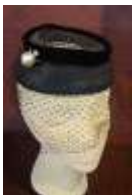
#79 Black woven straw with velvet ribbon crown and open straw top, short veil with large pearl and rhinestones