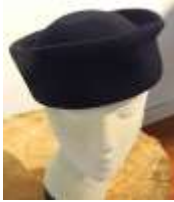
#67 "Miss Bierner" navy wool felt