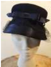
#70 Black wool, cloche style with satin ribbon, bow, veil