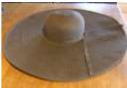
#23 "San Diego Hat Co." WIDE brim, 24" olive green sun hat