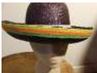
#148 Black woven straw with multi-colored brim