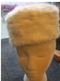
#17 "Andre' Paris/New York", traditional white mink winter hat