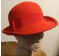
#167 "Modesa/Made in France" red wool bowler with red grosgrain ribbon