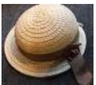
#189 Small child's straw hat with tan grosgrain ribbon and dried flowers