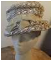
#91 Cream intricately woven straw with velvet bow