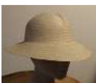
#126 Woven straw with indented crown