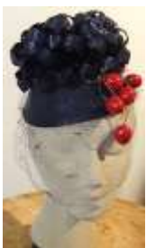
#57 "Mr. John" woven straw, accent grosgrain ribbon, bakelite cherries, veil