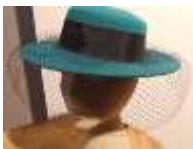
#180 "Liz Claiborne" teal wool with gray veil and gray grosgrain ribbon