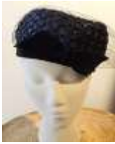
#87 Black woven straw and ribbon with velvet ribbon band and bow, black veil