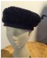
#61 Stitched straw with beading texture, grosgrain band and bow accent