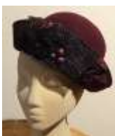
#181 "Victorian Addiction" copy of Victorian era hat – Wine velour with elaborate brim decorations