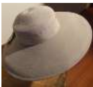
#140 "Cathay/California" woven straw with matching grosgrain ribbon band