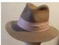
#108 "Bollman Designer Collection" tan safari with peach silk band