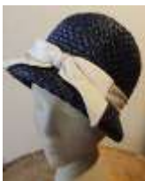
#92 "Betmar" navy woven straw cloche with cream linen ribbon