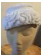
#93 "Ruth McCabe/1963 inscription" – White fur with sequins, velvet white ribbon (union-made #623987)