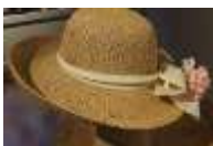
#188 "Importina" woven straw with silk ribbon and silk pink carnations