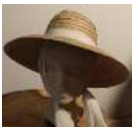
#190 Straw with cream linen scarf tie