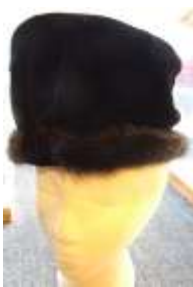
#18 "Karen Design" black velvet with mink trim