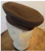
#53 "Mr. John" modified tam style, brown felt with hat pins