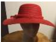
#147 Red woven straw with red woven straw ribbon band