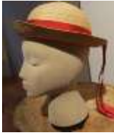
#135 "I. Magnin" small, possibly child's hat of woven straw with long red grosgrain ribbon