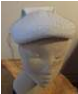
#97 I. Magnin white wool with grey veil