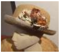
#186 Woven tweed-like straw, lace insert with silk flowers