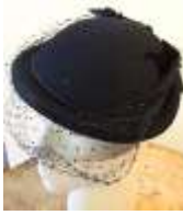
#81 I. Magnin Importers black wool, veil, black ribbon and feather accents; 2 matching hat pins