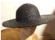
#149 Intricately woven black straw