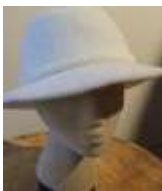
#101 "Everitt" cream sweater fedora