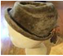
#51 "Luci Puci"; Brushed velour with stitched grosgrain bow and feathers