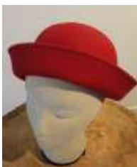
#25 "Commodore Litefelt" red bowler style