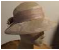
#184 Loosely woven fine straw with woven straw band and bow