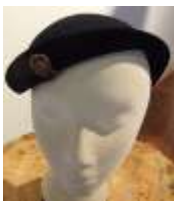
#64 "I. Magnin" black felt with black velour, multi-colored beaded accents