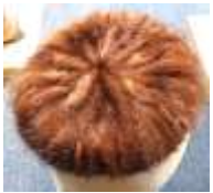
#21 "Mr. Henri" – Brown mink pill box