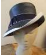
#73 "Coralie" black and white fedora style with grosgrain ribbon, black and white trim