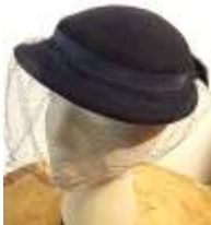
#62 "Hattie Carnegie/I. Magnin" navy brushed felt with rose veil, grosgrain ribbon