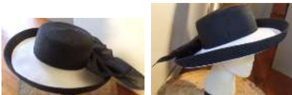
#72 "San Diego Hat Co." black & white woven straw with tafetta ribbon at back (one of the two hats used in the movie "Pretty Woman", worn by Julie Roberts in the scene at the polo match)