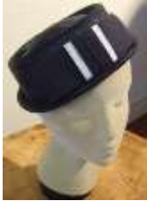
#59 Navy woven straw with navy and white wide grosgrain ribbon