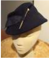
#168 Wool crushed cloche with pearl tipped accent