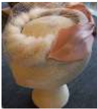
#16 Cream mink trim on brim of felt hat with veil and peach bow