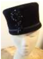
#76 "Modern Miss – Made in Italy" black velvet pillbox with grosgrain ribbon, jet glass bead accent