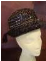
#90 "Milbrae Exclusives" chocolate brown woven straw fedora with brown grosgrain ribbon