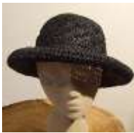
#139 "Hat Stuff" black woven straw, tightly woven brim, looser crown with raffia ribbon